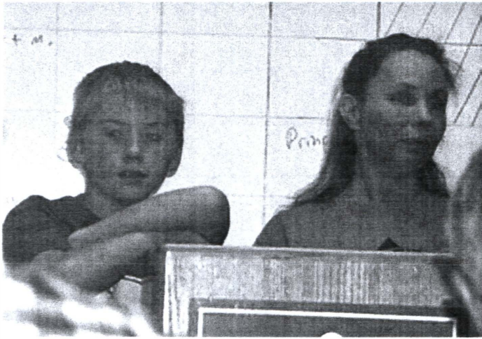
Abductees speaking about their experiences, above.

The woman commented that her somewhat rural neighborhood, located west of Portsmouth, Ohio, seems to be a hotspot for UFO and abduction related activity. She and others have observed an unusual number of black SUVs in the area, not owned by the people who live there. Men resembling the notorious Men in Black have also been seen. They are described as being Asian or cadaver looking. This woman and others have reported that personal items such as silverware (in particular forks), jewelry and film have turned up missing from their homes, to be replaced with a rock or other similar mundane item. These items are later exchanged again. For example, this woman reported losing a necklace from her jewelry box that had some sentimental value to her. A rock was left in its place. She later found the necklace hanging outside on a fence post, to discover that the rock that had earlier replaced it had disappeared.